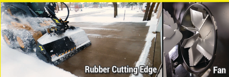
Rubber Cutting Edge